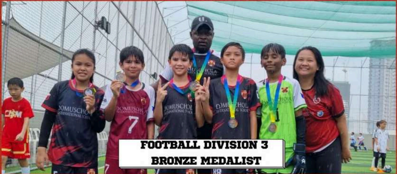
FOOTBALL DIVISION 3 BRONZE MEDALIST