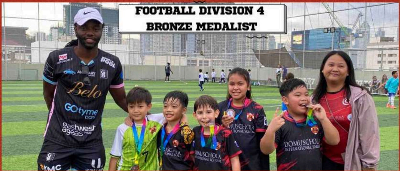
FOOTBALL DIVISION 4 BRONZE MEDALIST