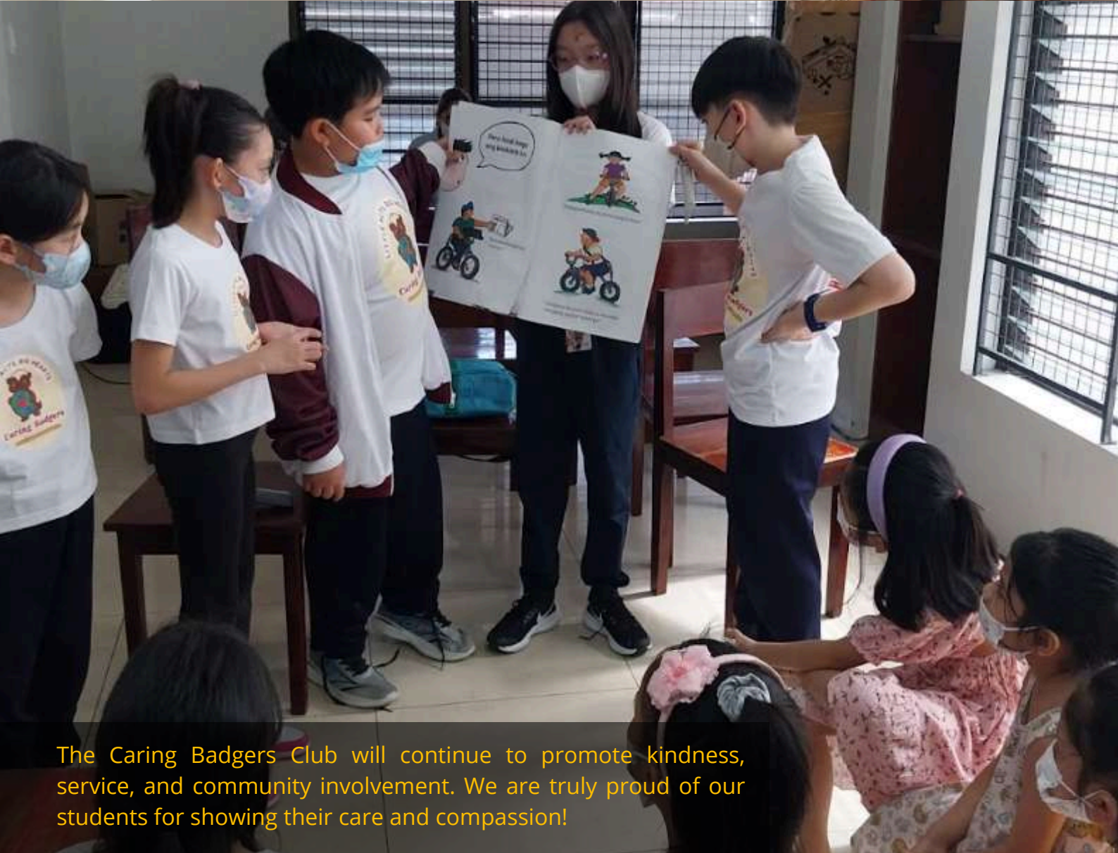
The Caring Badgers Club will continue to promote kindness, service, and community involvement. We are truly proud of our students for showing their care and compassion!